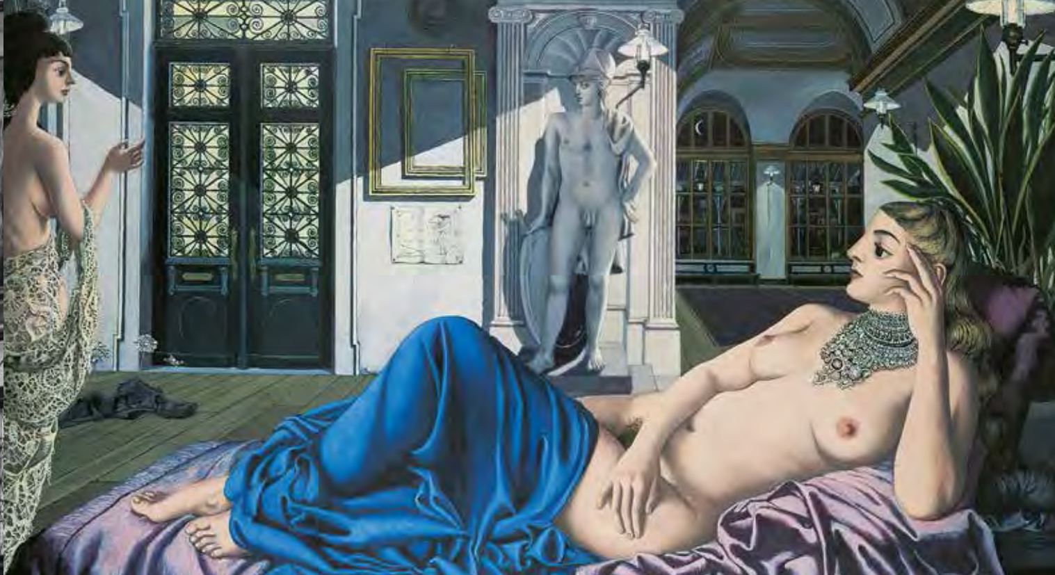
Eloge de la mélancolie (The Adulation of Melancholy), 1948 | Oil on panel, 153 x 255 cm | Private collection | © Paul Delvaux Foundation, St. Idesbald, Belgium

I would like to paint a fabulous picture, in which I would live, in which I would be able to live.